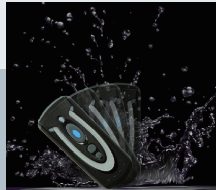
Rugged and Durable