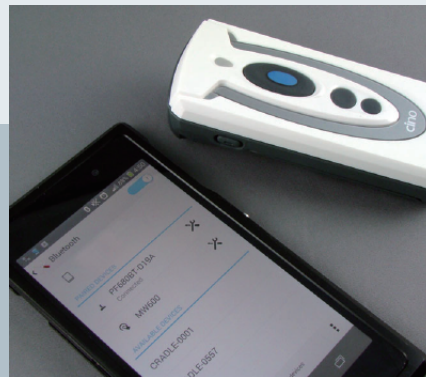
Bluetooth v 4.0 Technology

Cino Bluetooth pocket scanner can work with non-Bluetooth hosts, such as traditional desk top computer, through smart cradle in PAIR mode or PICO mode. This provides an instant plug-and-play cordless migration solution. In PICO mode, one smart cradle supports up to 7 scanners simultaneously. This can reduce the total IT infrastructure cost.