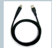
Cable: USB PS/2 RS232 Micro USB