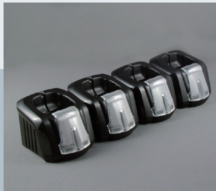
Multi-slot Cradle Solution