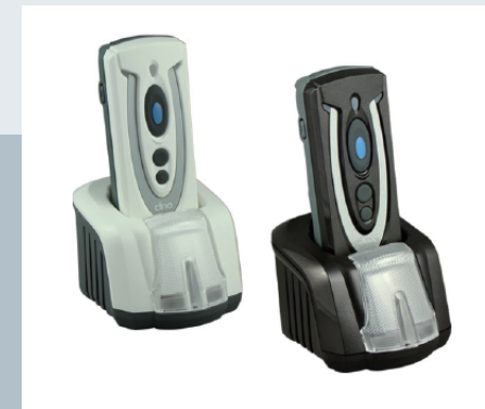
Smart Cradle Solution