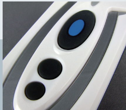
User-friendly Function Keys

The Cino Bluetooth pocket scanner is equipped with one big trigger button and two function buttons. These two function buttons allow you to enter power-off, sleep mode quickly without scanning the command barcodes. For example, when you use the scanner to work with iOS device, you can switch between barcode scanning and iOS device's on-screen keyboard quickly by pressing the function button twice. The friendly usability allows you to switch to different operations easily.