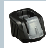
Smart Cradle Charging Cradle