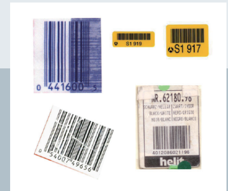
No Worry for Poor Barcodes

Thanks to FuzzyScan 3.0 imaging technology, Cino Bluetooth pocket scanner is capable of reading low contrast, damaged, smudged, poorly-printed and laminated barcodes that are commonly found in the real world quickly and accurately. To meet the emerging mobile commerce application, it can read paper-based and electronic bar codes shown on LCD screen. This makes the whole scanning process more efficiently and extra handling cost will be minimized.