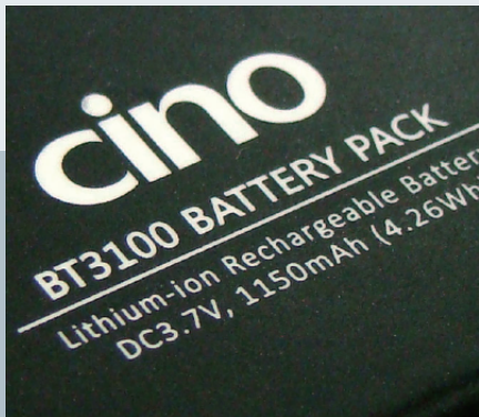
Efficient Power Management

Thanks to the special designed mounting holes, the smart cradle can be flexibly linked together to form a multi-slot cradle by a small hard plate. You can get an instant multi-slot cradle solution without any extra investment and effort.