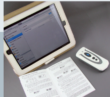
Several Radio Link Modes