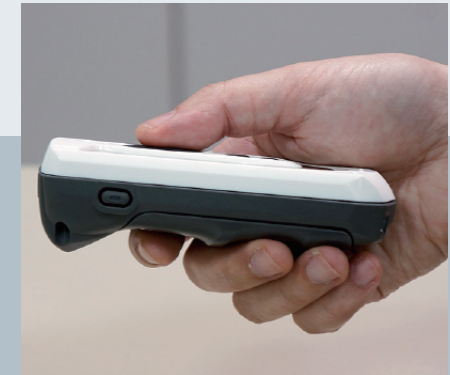
Ergonomic Outer Shell