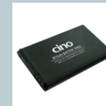
Battery: 1150mAh 2300mAh