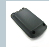
Battery Cover (for 2300mAh)